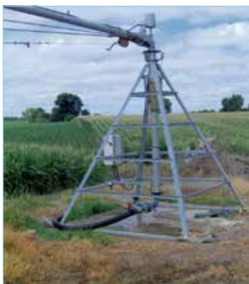
TOWABLE PIVOT ON SKIS

The movement of the machine from one to the next position requires a tractor after the user has turned the wheels of the spans in position to be towed.