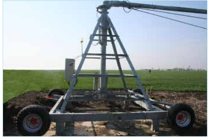
TOWABLE PIVOT ON WHEELS