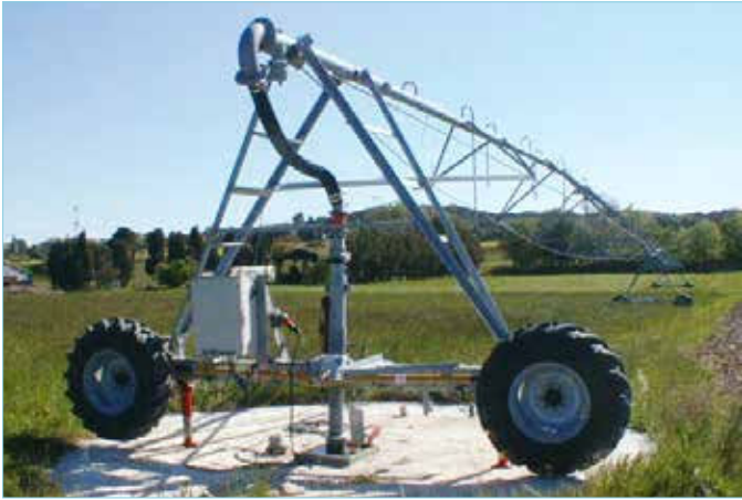
THE SPEEDY MULTICENTRE