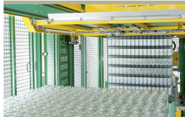
Vertically moving layer collection table and collection conveyor in divided execution

Deutsche Extrakt Kaffee GmbH (DEK) in Hamburg is one of the leading suppliers of instant coffee and instant coffee beverages to the retail own-brand market. The company was founded in 1955 and belongs to the Cafea Group.