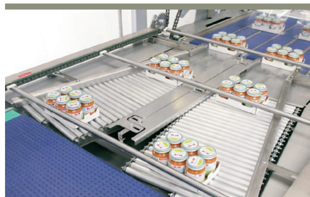
Double-lane infeed in front of the shrink-film wrapper

The company HiPP from Pfaffenhofen, Germany is an enterprise rich in tradition. It produces organic food for babies and toddlers and sells around 230 products into all corners of the world. The company has production facilities and areas of cultivation in Germany, Austria, Croatia, Russia, Hungary, Switzerland and the Ukraine.