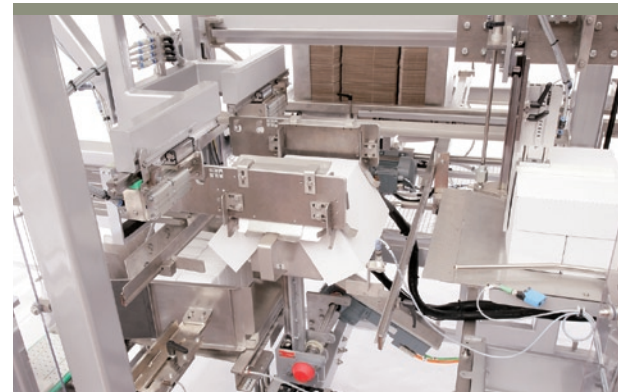
Lifting the product formation into the lid forming station