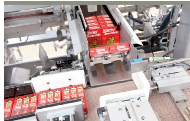
Separating two lying packs and then erecting them in the grouping station on the VP 450 K