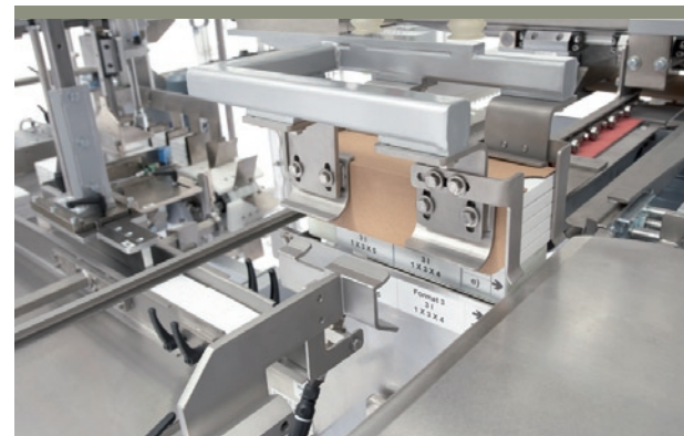
Positioning above the tray blank